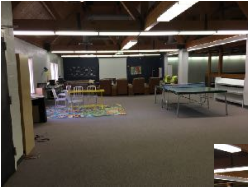
Track Meeting area of the Wilder Center (open to below) Access on 2nd floor from stairs or elevator