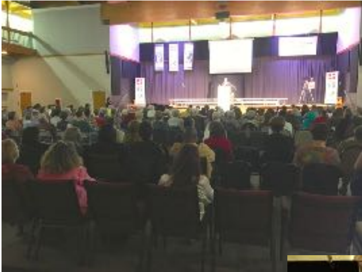
Garnet M. Wilder Main Center area (Track above) Has large stage area