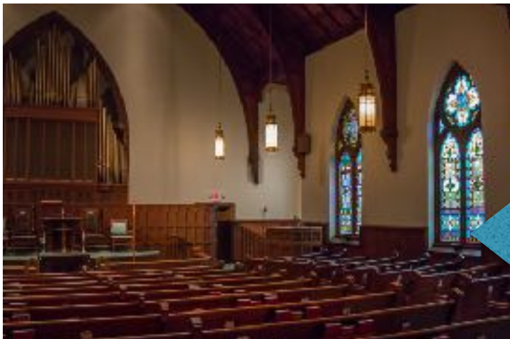
Historical Sanctuary Main area with fixed