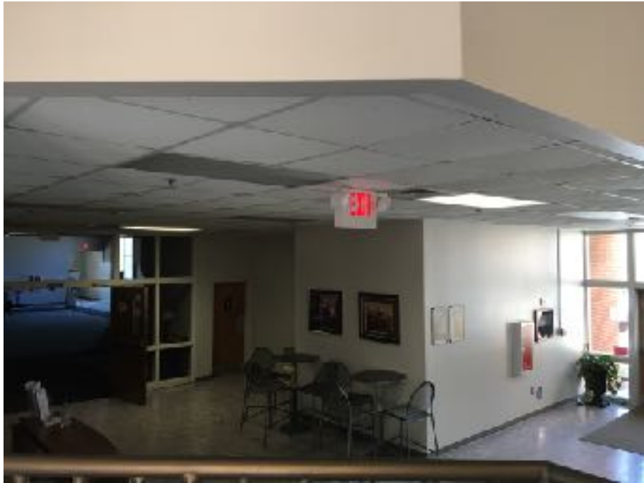
Wilder Center Lobby *Access to parking lot

(this area leads into the main center, dining room, living room and stairwell to classrooms)