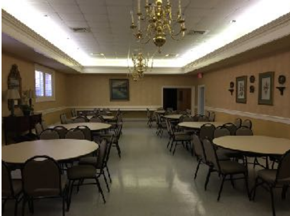
Wilder Dining Room

Can accommodate 8 round tables that seat 10 people. Other configurations are possible.